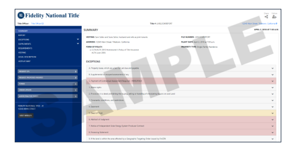
Effortless, Efficient, Compliant, and Accessible

To view your new Fidelity National Title First Alert powered by LiveLOOK report, Click Here